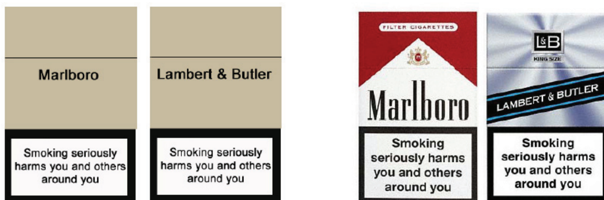
Examples of what plain packs may look like, compared to existing packs.

The UK Tobacco Advertising and Promotion Act has been effective in removing overt promotional activity and has brought about a consequent reduction in awareness of tobacco marketing amongst the young. 9 However, branding continues to drive teen smoking, and awareness of packaging and new pack design is a key element of this ongoing marketing. 10,11 Since the Act was implemented, the tobacco industry has responded by investing more resources into packaging design (as well as point of sale display ) in order to communicate brand imagery and increase sales. Research shows that this has already had an effect: between 2002 and 2006 there was an increase in the proportion of young people aware of new pack design from 11% at 2002 to 18% in 2006. 9