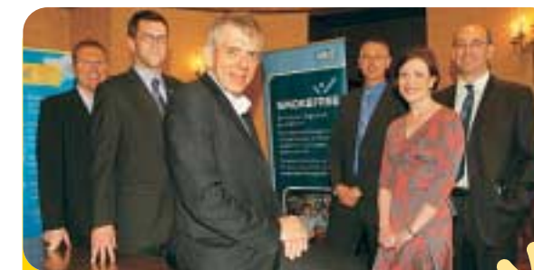
Speakers at the event.

Fresh is now forging ahead with the work programme for Year 3 and there will be a series of planning sessions held on key topic areas such as smoking and pregnancy; young people; helping smokers to stop; regulation, availability and supply.