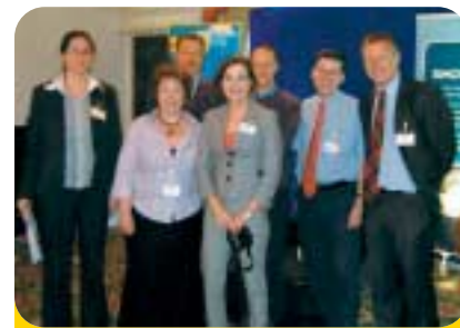
Practice Sharing Forum

The final part of the NPRI session was a round table discussion on