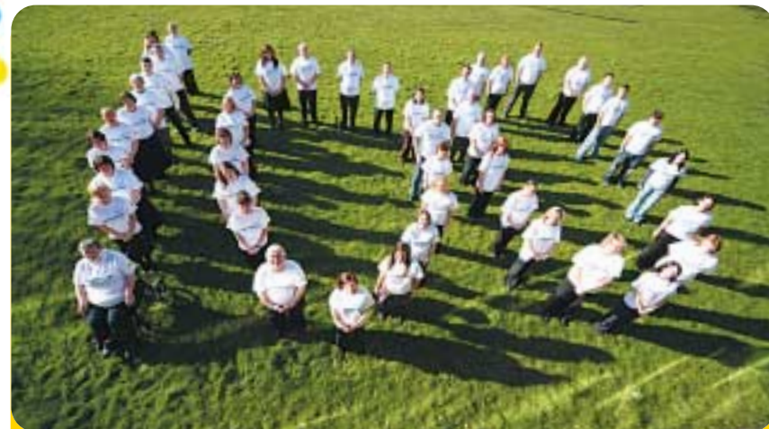
Volunteers for the '100 Days to Go' photo shoot.

Across the region numerous events were organised by the Local Authorities and Local Alliances and the media were provided with details of their relevant events.